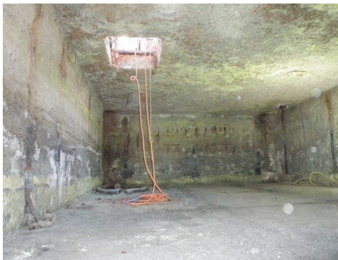
Sulfur Pit (Before)