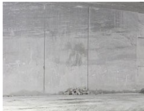
Sulfur Pit (After)