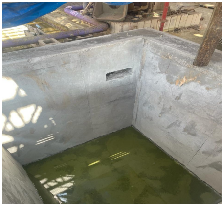
ACID GUARD PC Acid Pit