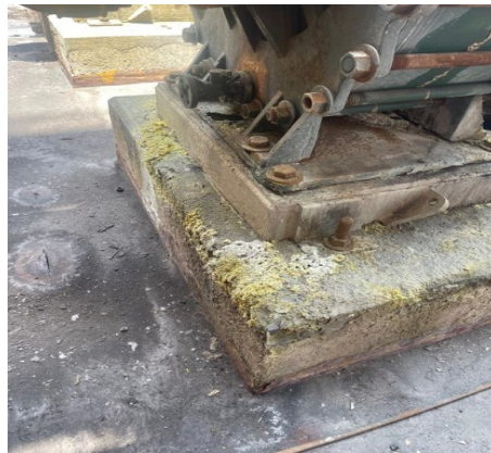
ACID GUARD 135 Pump Base after one year