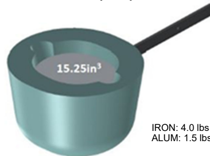
3.5" Sample Spoon