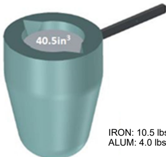
5" Sample Spoon