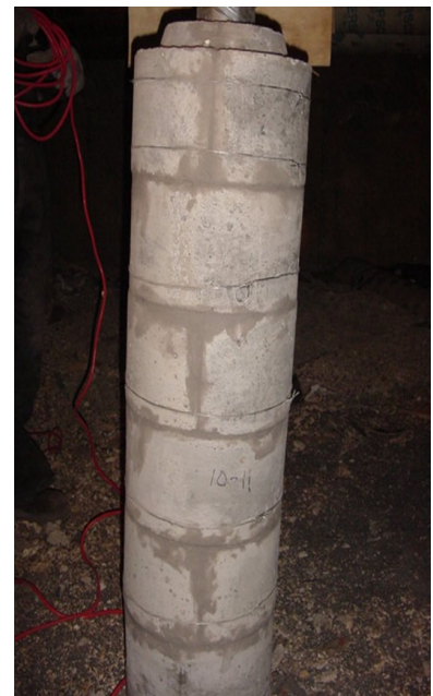
Precast shapes for stand pipes