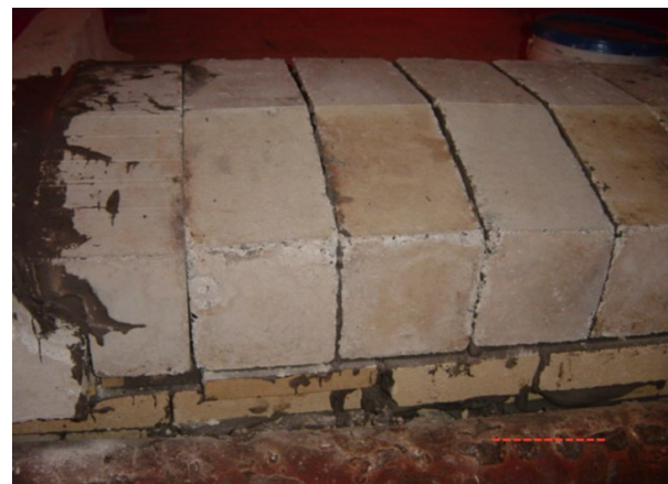
Ceramic Starter Blocks