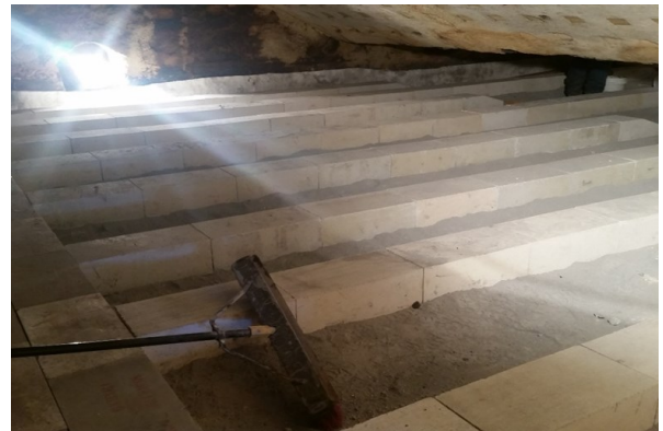
Ceramic Skid Blocks