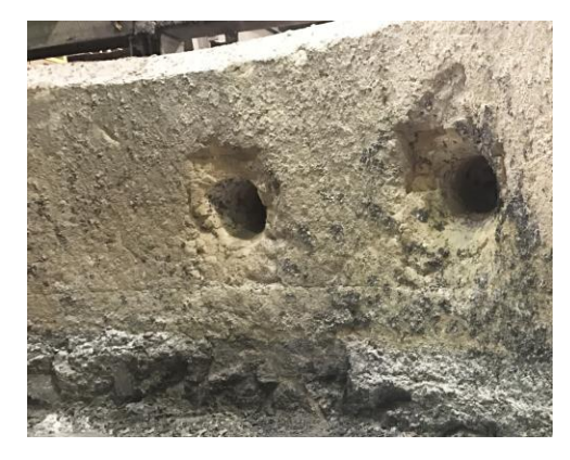
Furnace at current state