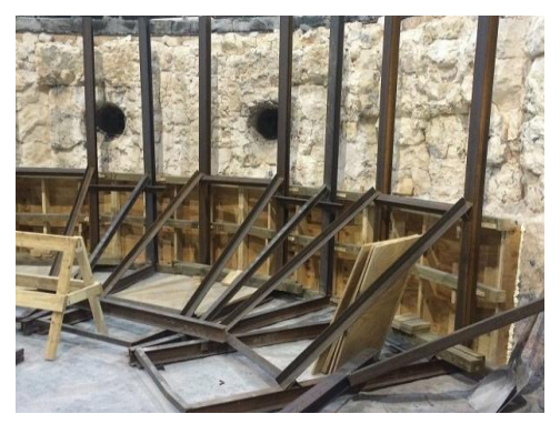
Lower wall form