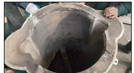
Ladle with LADLE VIBE® 88