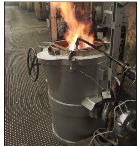
Picture of actual ladle