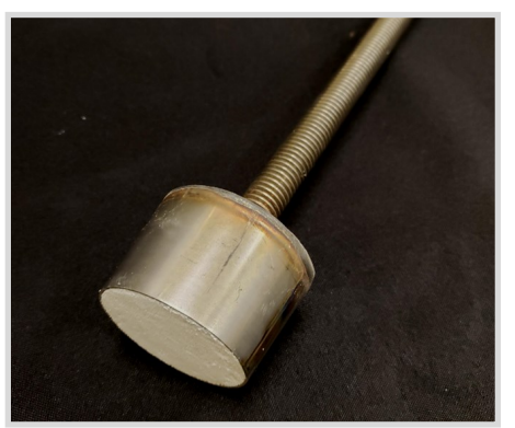
Shrouded Mini Nozzle