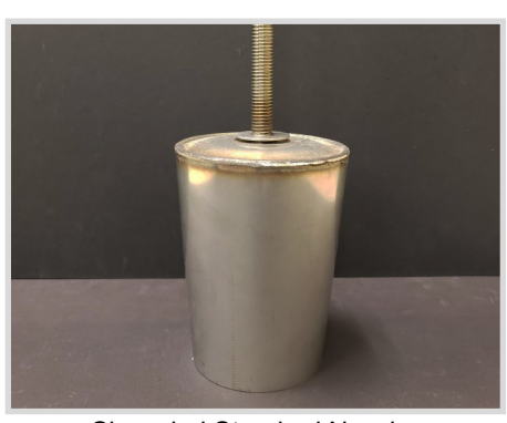
Shrouded Standard Nozzle